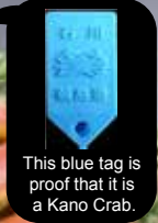
This blue tag is proof that it is a Kano Crab.