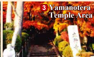
3 Yamanotera Temple Area

This temple has 1300 years of history and is surrounded by natural beauty. The expansive grounds have dazzling scenery with its harmonious blend of rocky mountains, lakes and red autumn leaves. *Period for autumn leaves: Early November – Late November Access: 25 minutes by train from Kanazawa Station → Alight at JR Kaga Onsen Station → 30 minutes by Kaga CAN Bus on the Interior Route → Alight at Natadera Temple Contact: Natadera Temple (TEL: 0761-65-2111)