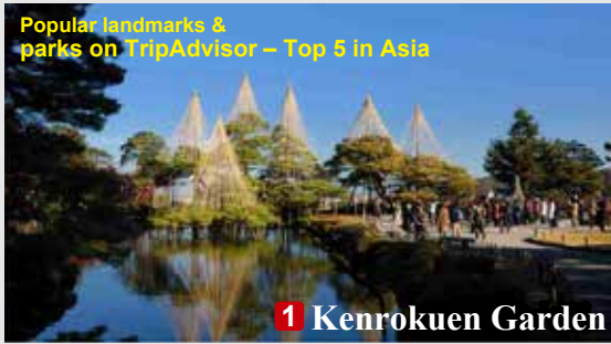
1 Kenrokuen Garden

Popular landmarks & parks on TripAdvisor – Top 5 in Asia