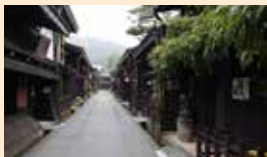
Old Town (Takayama)