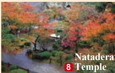
8 Natadera Temple

Take a walk along the path that follows the stream and get a 360° view of breath taking scenery. * Period for the autumn leaves: Early November – Late November Access: 25 minutes by train from Kanazawa Station → Alight at JR Kaga Onsen Station → 24 minutes by Kaga CAN Bus on the Interior Route → Alight at Yamanaka Onsen Kiku no Yu/Yamanaka-za Contact: Yamanaka Onsen Tourism Association (TEL: 0761-78-0330)