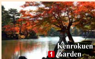
1 Kenrokuen Garden

↓ There are other great spots in Ishikawa to view the autumn leaves. ↓