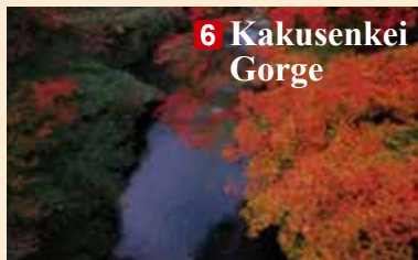
6 Kakusenkei Gorge

A symbol of Ishikawa, the garden is popular amongst tourists and locals alike. Many come to view the beautiful scenery during the period when the leaves turn red. *Period for the autumn leaves: Early November – Early December Access: 20 minutes by Kanazawa Loop Bus from Kanazawa Station → Alight at Kenrokuen-shita Contact: Kanazawa Castle / Kenrokuen Management Office (TEL: 076-234-3800)