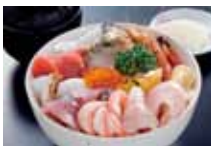
Fresh Local Seafood on the Notodon Rice Bowl