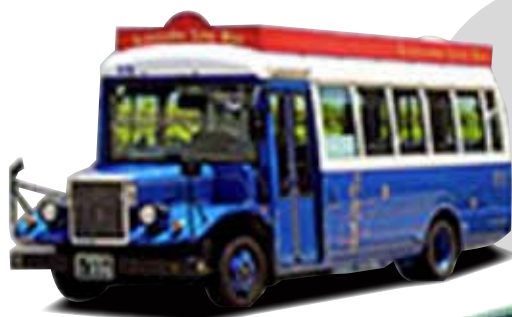
Kanazawa Loop Bus 1-Day Pass