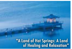
"A Land of Hot Springs: A Land of Healing and Relaxation"