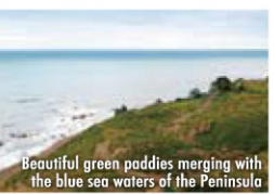
Beautiful green paddies merging with the blue sea waters of the Peninsula