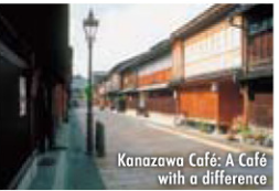
Kanazawa Café: A Café with a difference