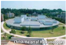
Chirish the art of Hyakumangoku

In Edo Period, Kanazawa prospered as one of Japan's leading cultural and economic cities. The charm and glory of those times continue to live on in the form of buildings, streets, stone walls, handicrafts and culture.