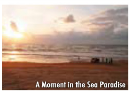
A Moment in the Sea Paradise

Noto has many small fishing port towns and traditional houses with black tiled roofs and black coloured wooden walls which are reminiscent of old Japan.