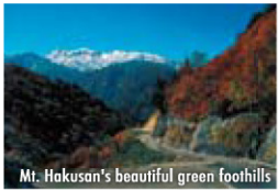
Mt. Hakusan's beautiful green foothills

Kaga is a place located at Mt. Hakusan and blessed by its Nature. Kaga City has a number of hot springs and the landscape with Mt. Hakusan as a backdrop is magnificent.