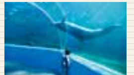
Notojima Aquarium (map G3)