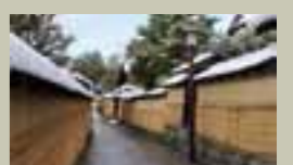
Samurai Residence Area (map G7)