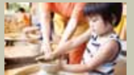
Traditional Handicrafts Village "Yunokuni-no-mori" (map G8)