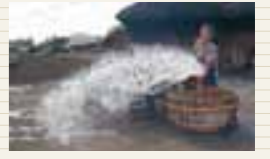
Oku-Noto Salt Farm Village (map G1)