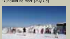
Hakusan Ichirino Hot Spring Ski Resort (map G9)