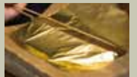
Sakuda Gold and Silver Leaf Shop (map G6)