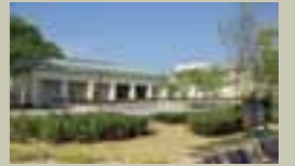
Ishikawa Prefectural Museum of Art (map G5)