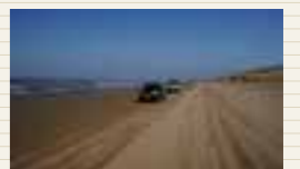
Chirihama Beach Driveway (map G4)