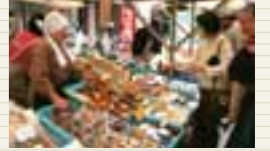
Wajima Morning Market (map G2)