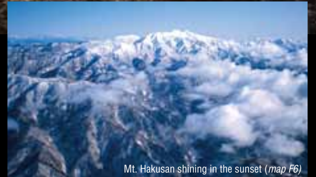
Mt. Hakusan shining in the sunset (map F6)

And last but not least, when you visit Ishikawa, you will experience the lives and warmth of the people who live in harmony with nature, in both mountain and seaside villages.