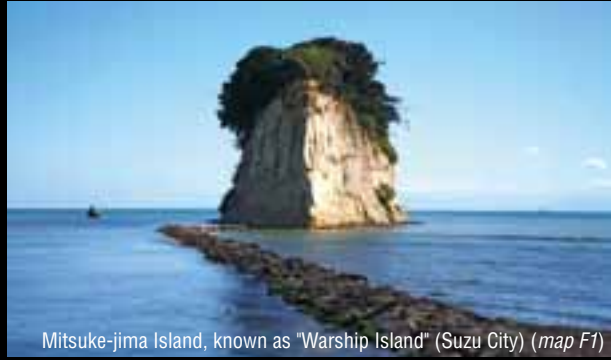
Mitsuke-jima Island, known as "Warship Island" (Suzu City) (map F1)