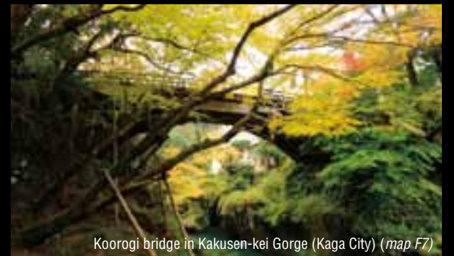
Koorogi bridge in Kakusen-kei Gorge (Kaga City) (map F7)