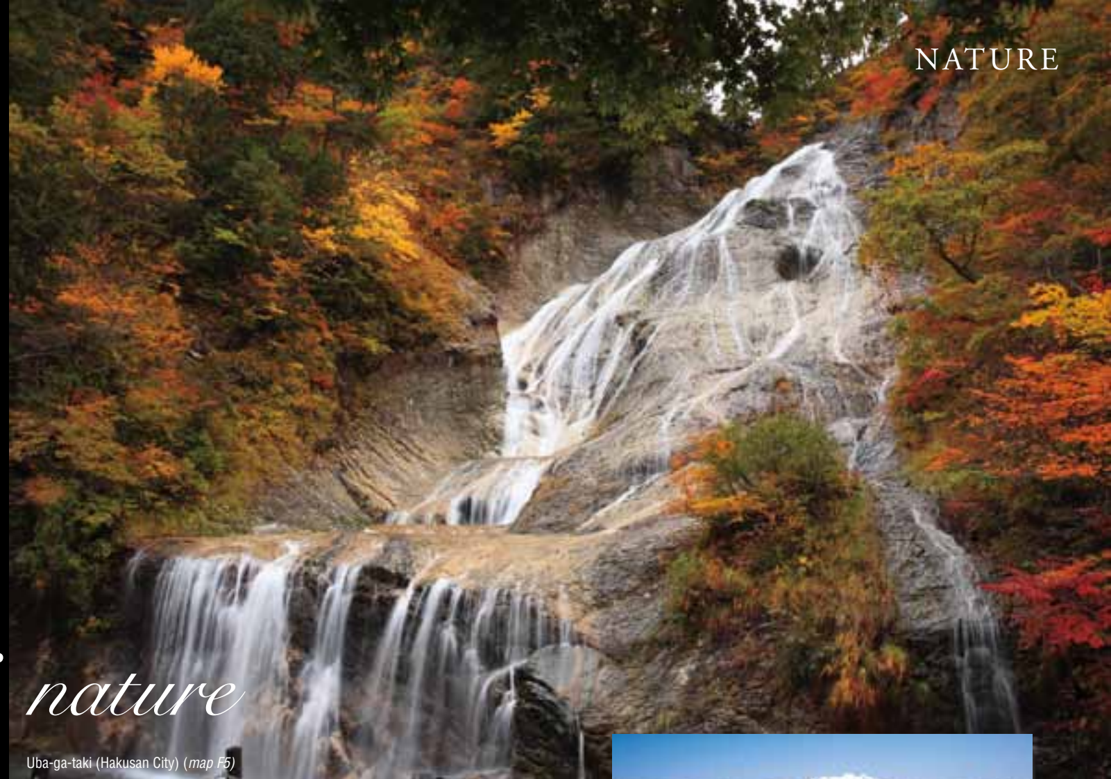
Uba-ga-taki (Hakusan City) (map F5)

Because Ishikawa has a peninsula that juts out into the Sea of Japan, it is a prefecture where changes in nature in both seaside and mountain areas can be enjoyed. Mount Hakusan, now a national park, is one of the three most famous mountains in Japan, and the place of origin of the Hakusan religious faith. There are also quasi-national parks along the coastlines of Kaga and Noto.