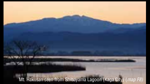
Mt. Hakusan seen from Shibayama Lagoon (Kaga City) (map F8)