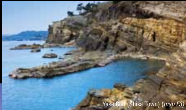
Yase Cliff (Shika Town) (map F3)