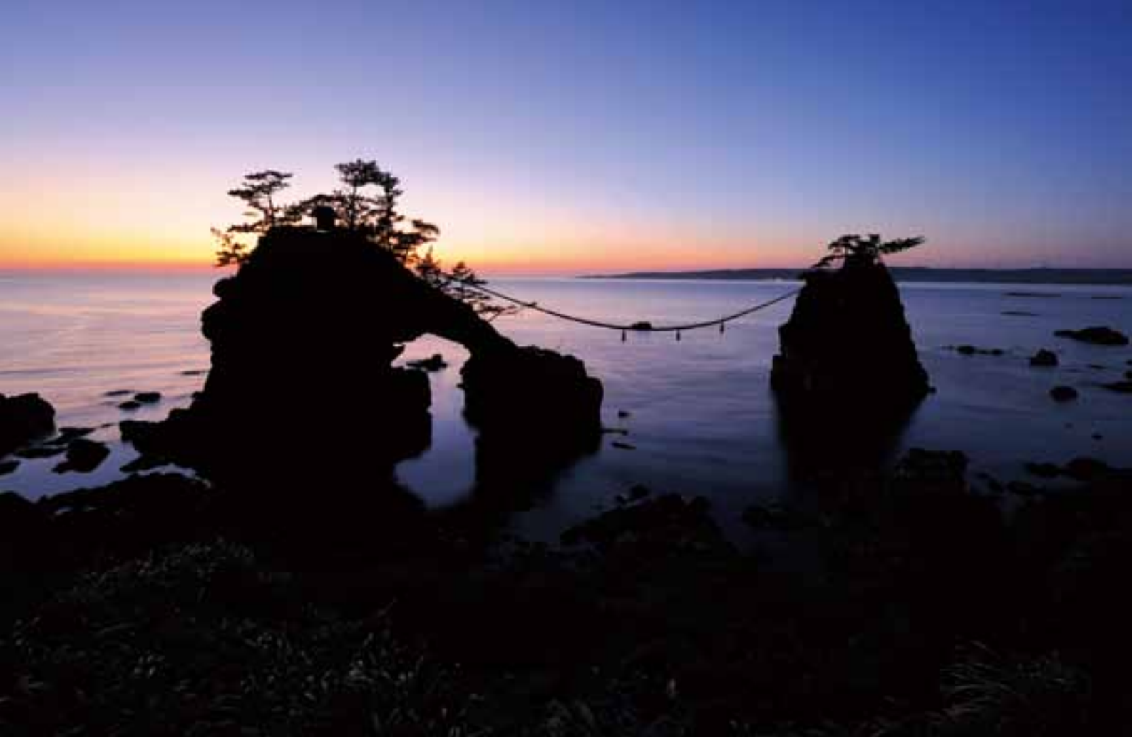
Noto Kongo rock formation (Shika Town) (map F4)